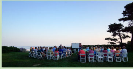
Annual Meeting 2023