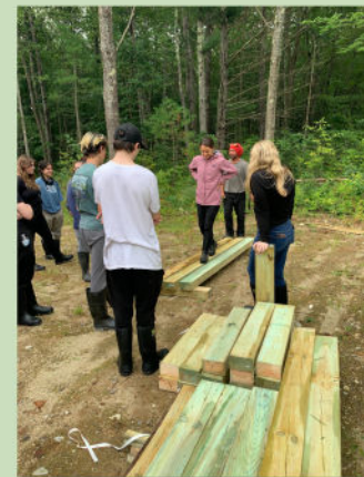
High School Students Trail Building

If you are interested in volunteering, we will be scheduling spring trail cleanup and more. Contact KLT or check the website for details.