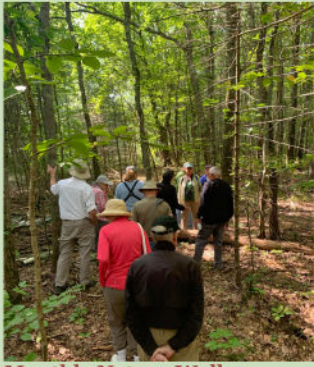
Monthly Nature Walks