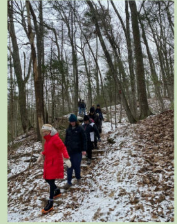
Snow Stroll February 2024