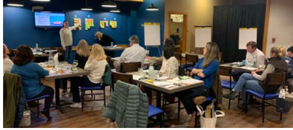
Kicking off a Strategic Planning Process