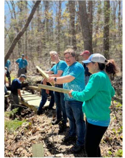
Volunteer Work Days