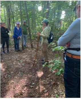
Monthly Nature Walks