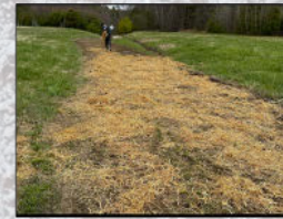
Trail Remediation Projects