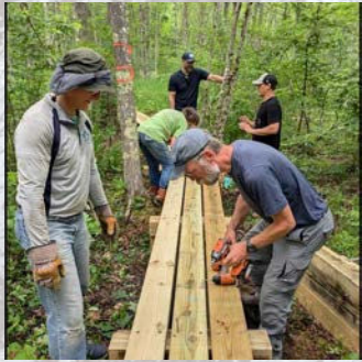
Volunteer Work Days