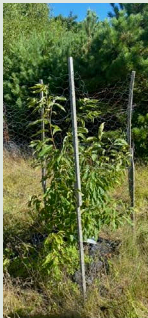
For All Forever Preserve

KLT is working with the American Chestnut Foundation to plant chestnut trees on our preserves, preserving the genetics of Maine trees. This will help restore chestnut groves in native locations and diversify the chestnut gene pool in preparation for new climate and pest challenges.